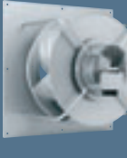
e. g. K36560 fan

8 centralised air conditioning units are operating in a shopping centre. With a duty cycle of 100% and ventilator operation according to actual requirements, the annual savings potential is 291 MWh and 34,081 euro. CO 2 emissions are reduced by about 175 tonnes.