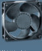
e. g. ACI 4400 axial compact fan

In a medium-sized factory are 50 control boxes with air filters running in continuous operation. Exchanging the conventional AC fans could save 6.5 MWh of energy over a year. The fans will have paid back the extra cost after just 4–6 months.