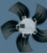
e. g. A36800 axial fan

6 fans work in one heat exchanger. At an average duty cycle of 75% this means an annual savings potential of over 24 MWh. This corresponds to approx. 14.4 tonnes of CO 2 and saves 2,814 euro*.