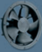
e. g. W16200 axial fan

A small supermarket operates 40 fans in the refrigeration counters. The lower intrinsic heating of the energy-saving motor allows a 30% shorter working time. Over a year, that means a savings potential of more than 9.4 MWh and 5.6 tonnes of CO 2 . Cost saving: 1,080 euro*.