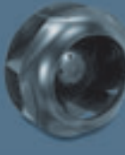
e. g. R36500 centrifugal fan

6 precision air conditioning units are working in the IT rooms of a computer centre, each equipped with 3 GreenTech EC fans. With a duty cycle of 100%, up to 50 MWh of electricity can be saved. That corresponds to about 30 tonnes of CO 2 and 5,898 euro* every year.